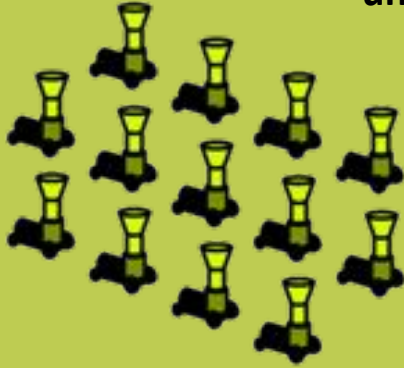
Malawi market potential