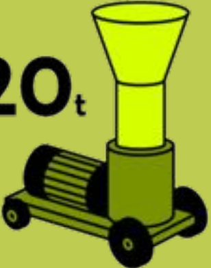
Production capacity per unit