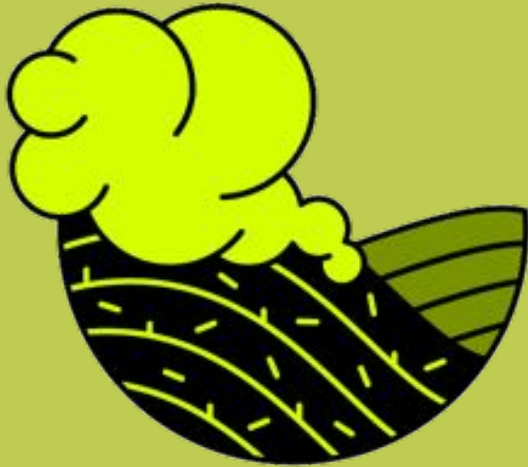
Burned agricultural waste