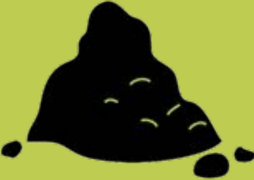
2021 woodfuel consumption