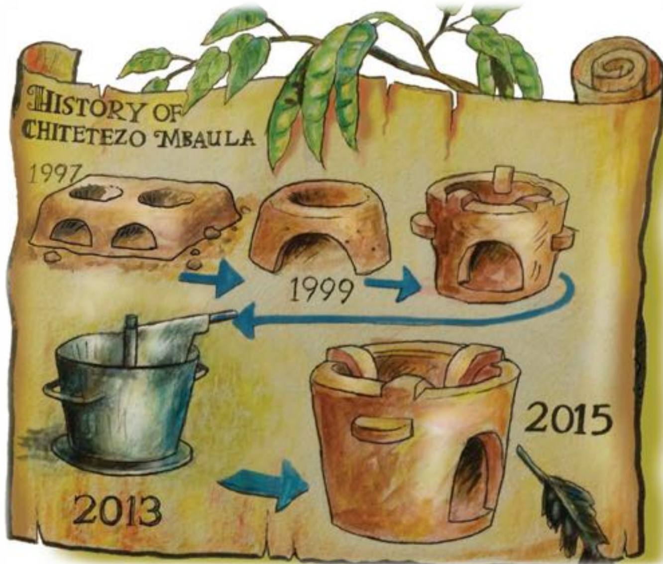
Illustration by Henderson Mawera

to give people more options to stack fuels with the same basic stove