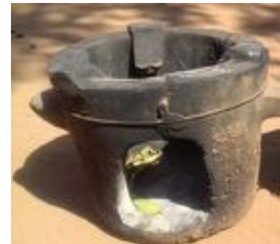
4 year old still in use